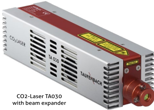
CO 2 -Laser TA030 with beam expander